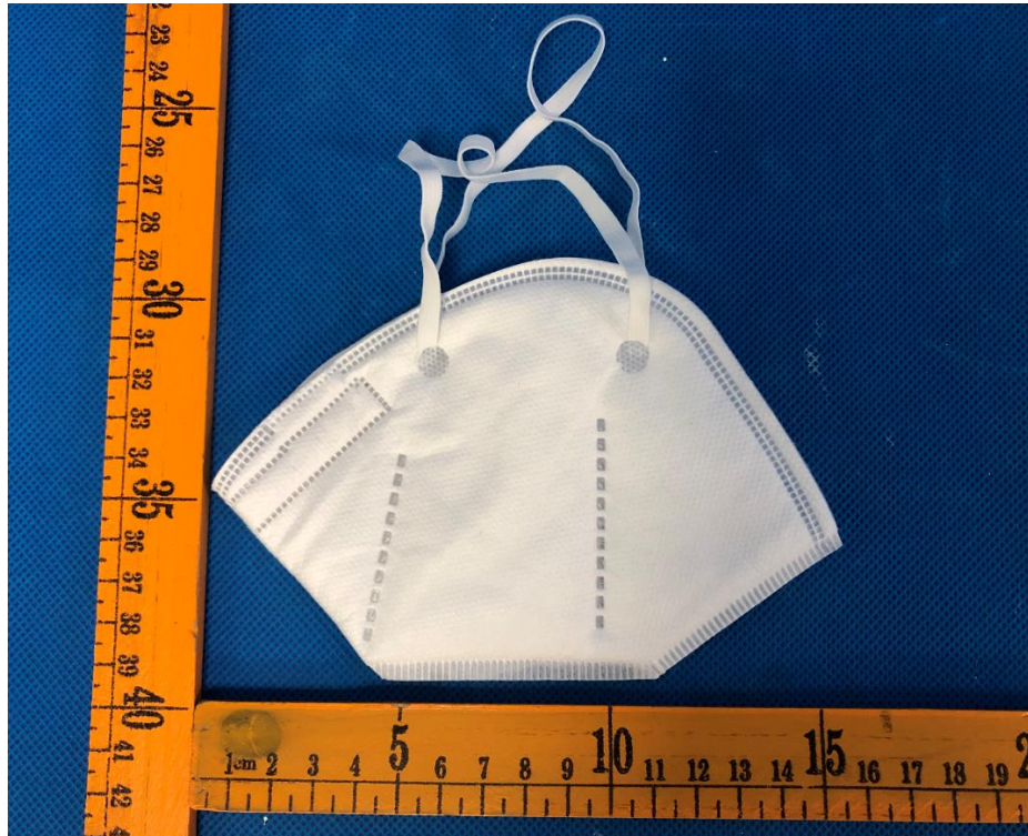
General view for KN95-PTMYKZ-01