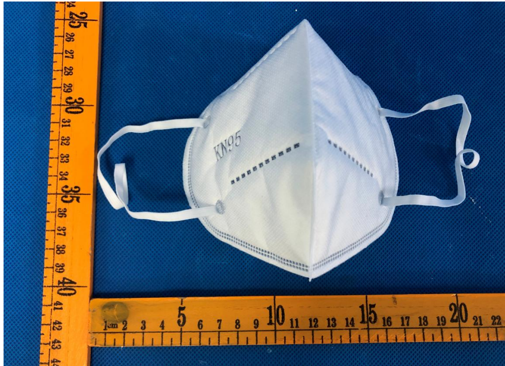
General view for KN95-PTMYKZ-01