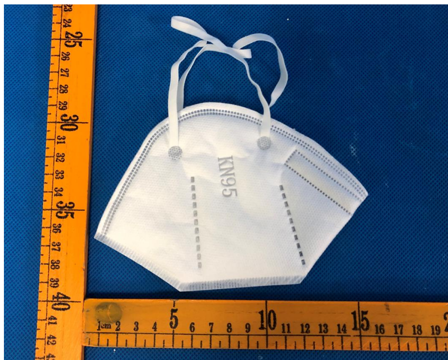
General view for KN95-PTMYKZ-01