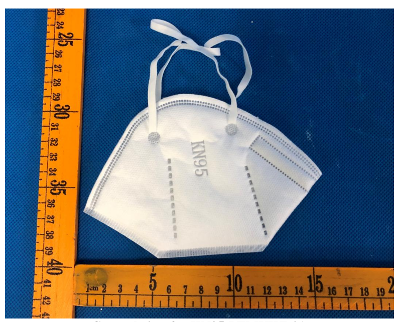
General view for KN95-PTMYKZ-01

Website: <a href="http://www.btktest.com.cn">http://www.btktest.com.cn</a>