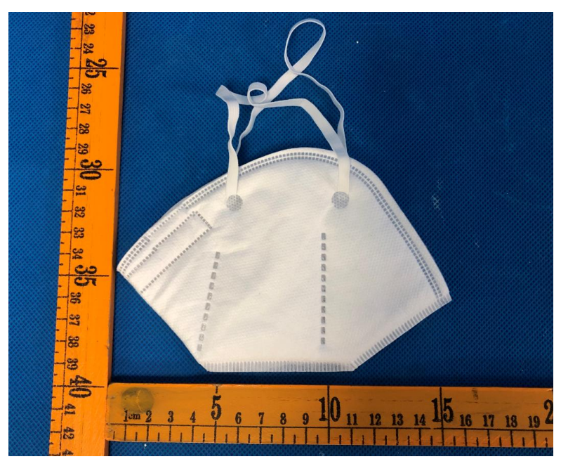
General view for KN95-PTMYKZ-01