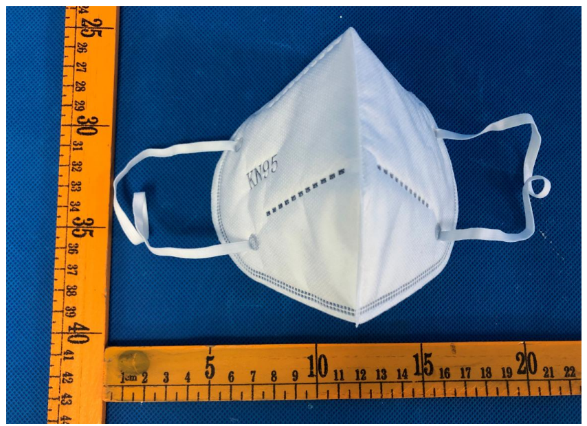
General view for KN95-PTMYKZ-01

Report No: BTK20200212002FDA Date: Mar. 13, 2020 Page 4 of 4